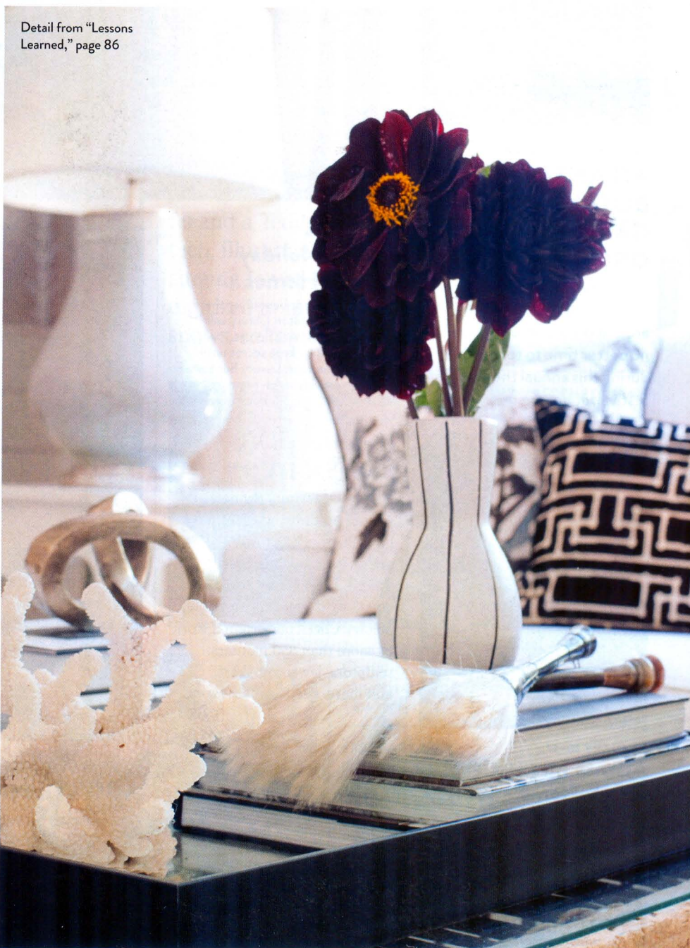
Detail from "Lessons Learned," page 86

Sitting room Sofa: Illuminati Antiques, illuminatiantiques.com. Sofa fabric: Libeco, libeco.com. Ottomans: Stanton Home Furnishings, stantonhomefurnishings.com. Dining room Chandelier: Currey & Company, from Redefined Home Boutique, redefinedhomeboutique.com. Settee: B.D. Jeffries, bdjeffries.com. Family room Gray chairs: Lee Industries, leeindustries.com. Rug: Designer Carpets, designercarpets.com. Sofa: Moss Studio, mossstudio.com. Settee: Four Hands, fourhands.com. Marble side tables: The Jack Ellis Company, thejackelliscompany.com. Screened porch Sofas: Restoration Hardware, restorationhardware.com. Table: Whitney Wolf, from The Jack Ellis Company. Master bedroom Chandelier: Made Goods, madegoods.com. Bed linens: Lili Alessandra, lilialessandra.com. Bedside chests: Stanton Home Furnishings. Custom bed, nikiebarfield.com. Kitchen Bryant chandelier: Circa, circalighting.com.