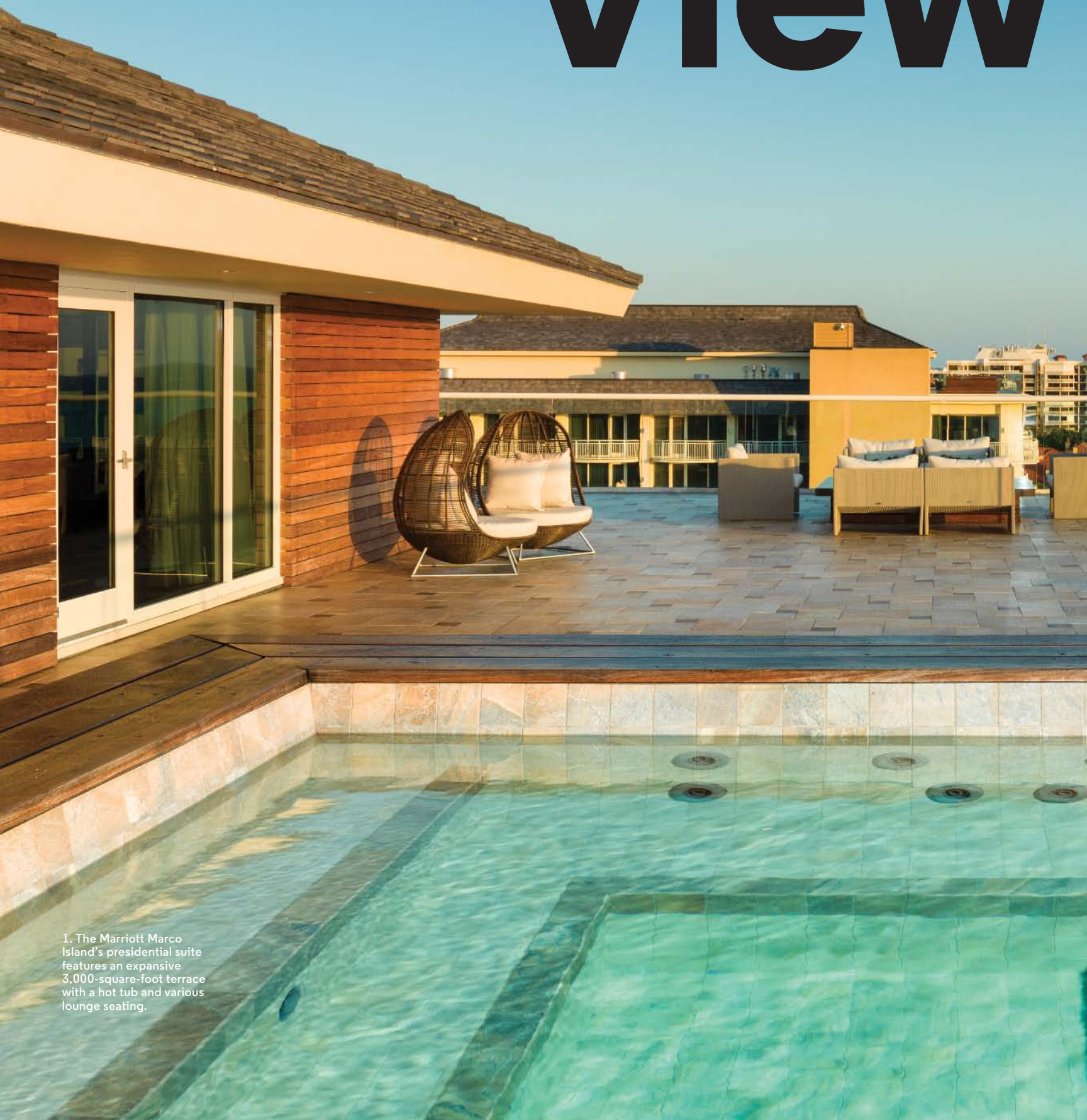
1. The Marriott Marco Island's presidential suite features an expansive 3,000-square-foot terrace with a hot tub and various lounge seating.