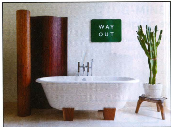
The Deauville tub, also by Victoria & Albert, has a more modern sensibility, with chunky wooden feet and European flair.

Standard sinks are also on the “out” list for both kitchens and baths. Trendy consumers are taking full advantage of