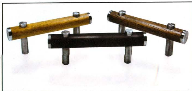
Reveal Designs honors Frank Lloyd Wright with the new Taliesin Design™ hardware collection, which fuses wood in metal in bold geometric shapes.

In 2011 it's all about the details, and decorative hardware continues to evolve with collections that add instant style and classic good looks for you to enjoy, such as Atlas Homewares' new Browning and Shelley collections, both named after England's most famous poets. They feature three pieces — a knob and two sizes of pulls — and are available in brushed or polished nickel and Venetian bronze.