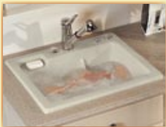
Innovative Laundry Sink

In an effort to help editors stay ahead of the kitchen and bath "trend" curve, we scoured the market for those products that are the most current, unique, and functional. Here's a recap of our picks.