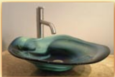
Exquisite Glass Workes of Art