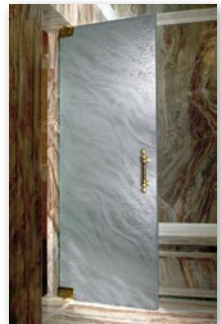
Contemporary Bath Design

RECAP OF NEW PRODUCTS UNVEILED AT THE KITCHEN & BATH SHOW IN CHICAGO