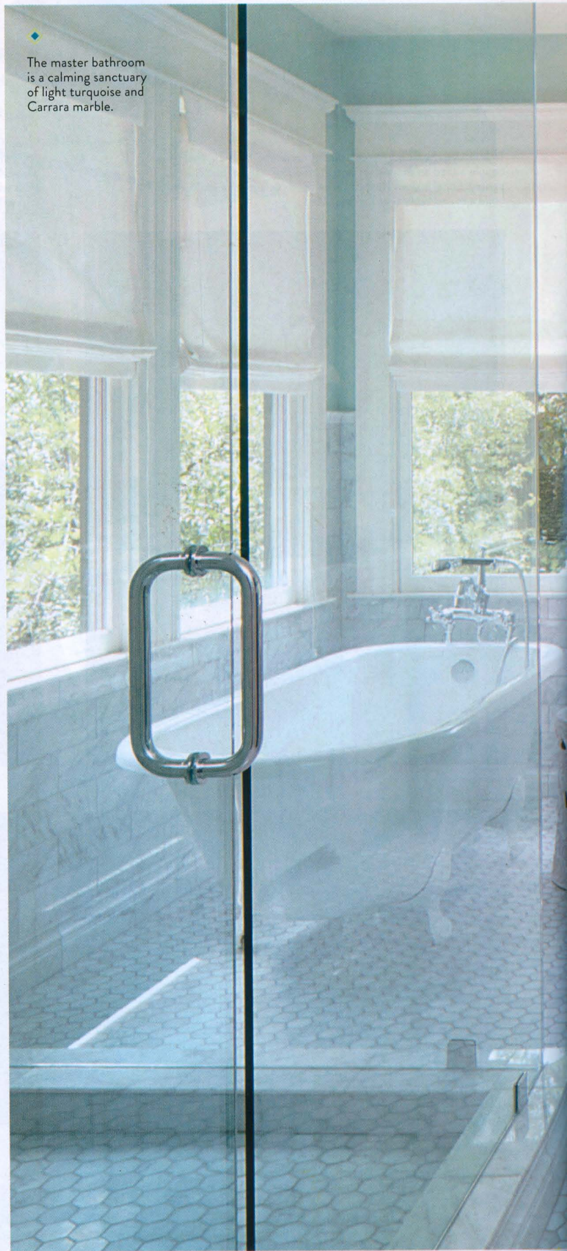
◆ The master bathroom is a calming sanctuary of light turquoise and Carrara marble.