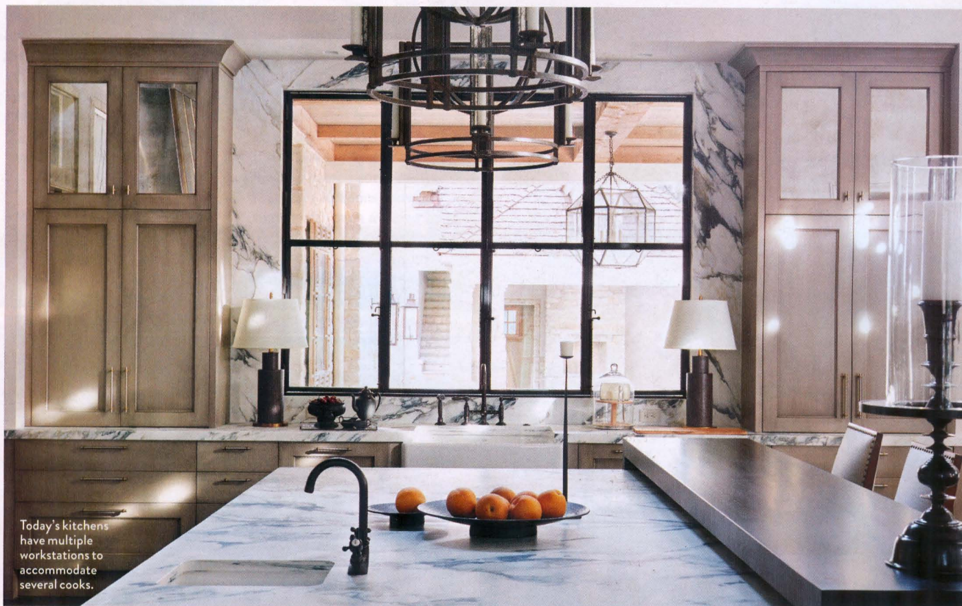
Today's kitchens have multiple workstations to accommodate several cooks.

one of the reasons I like to panel everything. Homeowners can insert their personality or update a kitchen through decorative hardware, light fixtures, art, and the colors of paint and fabrics.