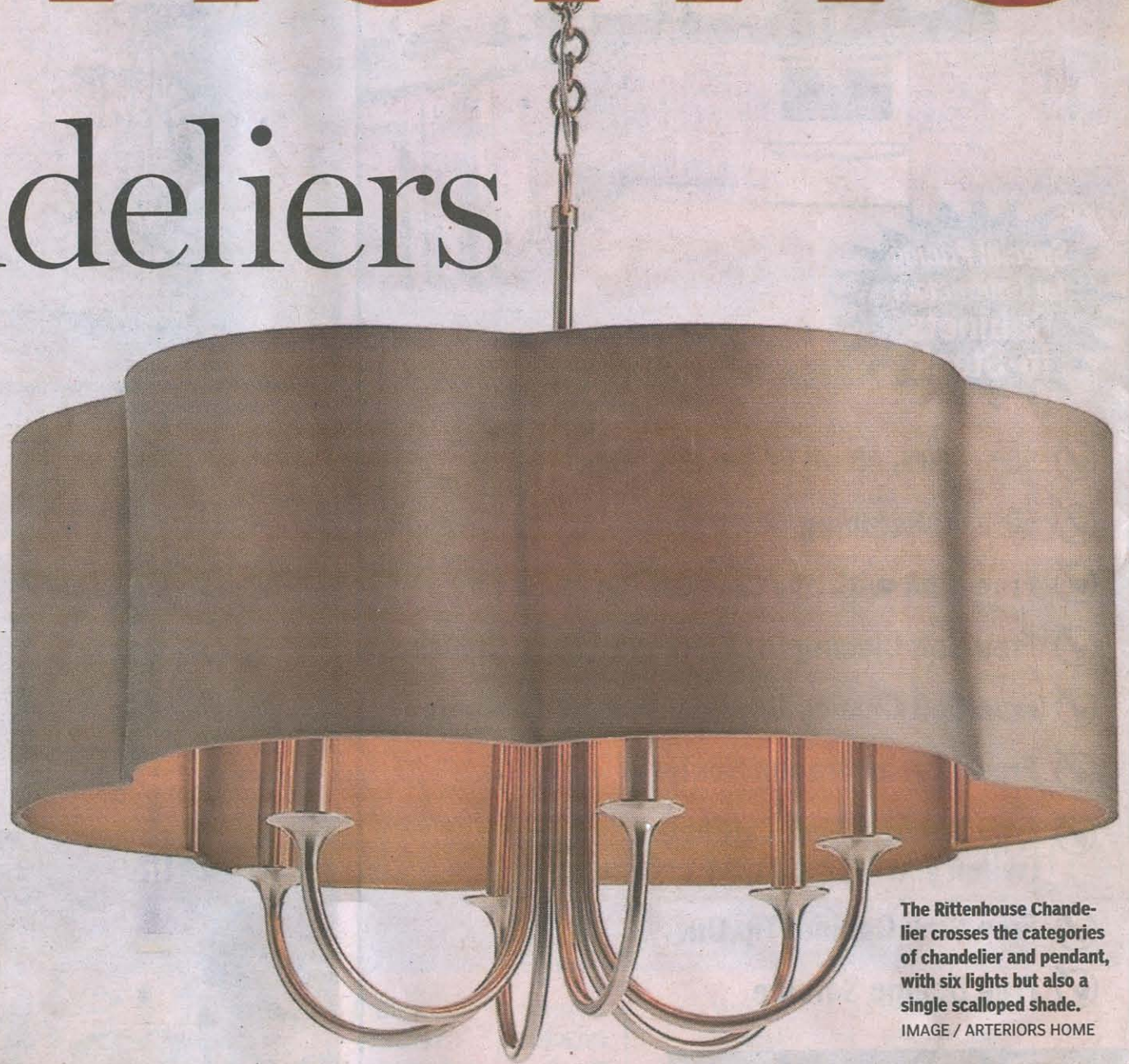
The Rittenhouse Chandelier crosses the categories of chandelier and pendant, with six lights but also a single scalloped shade.

Fixtures can evoke tradition without being stuffy. E4